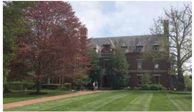
Springtime at Cap