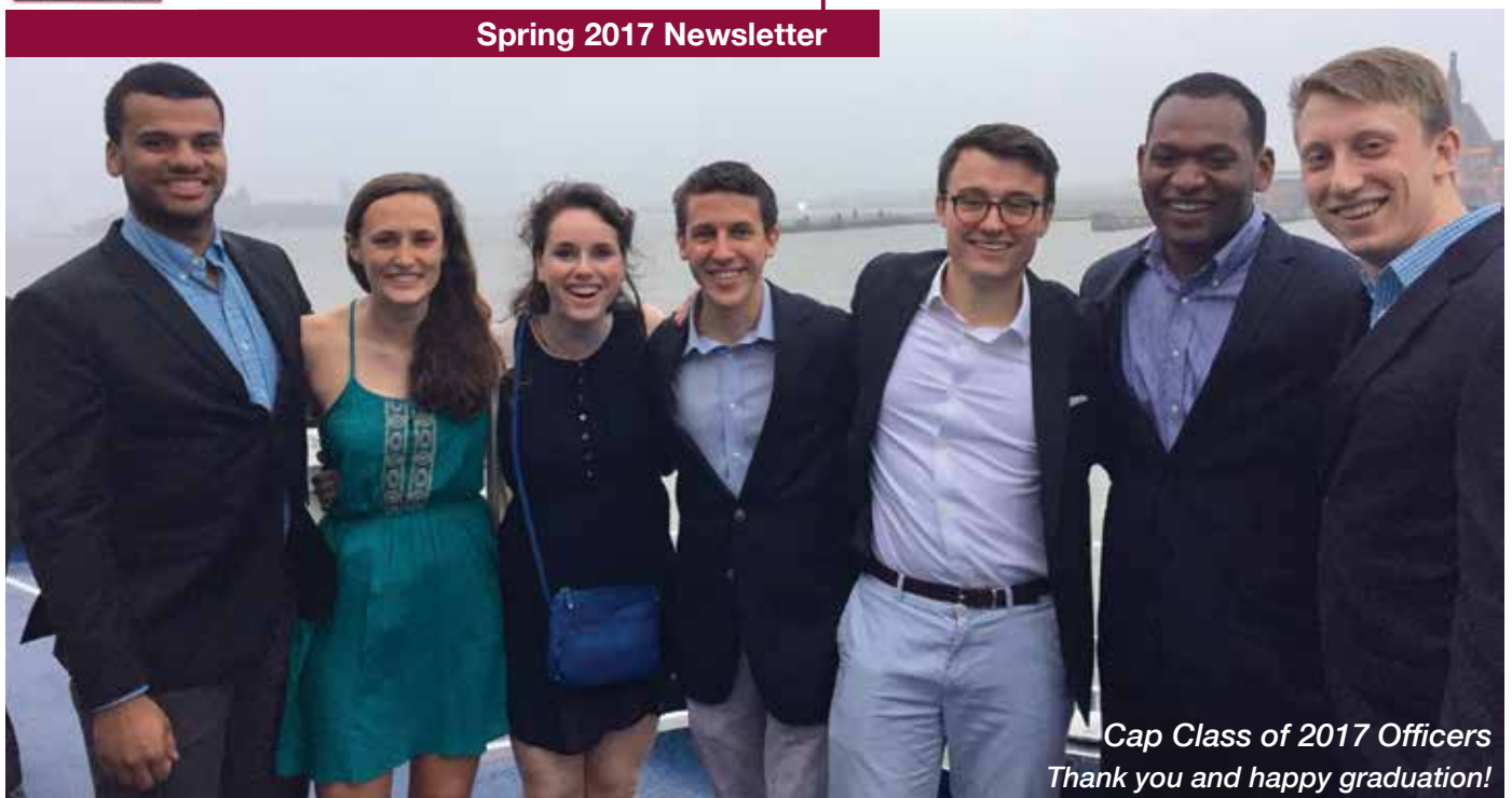
Cap Class of 2017 Officers Thank you and happy graduation!