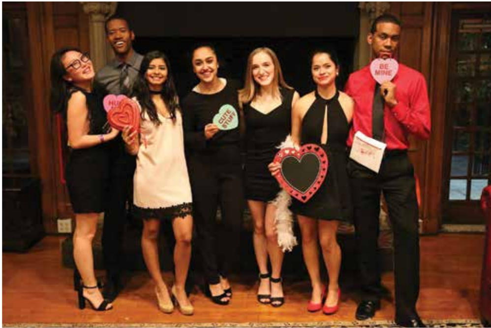
Valentine's Day Semi-Formal