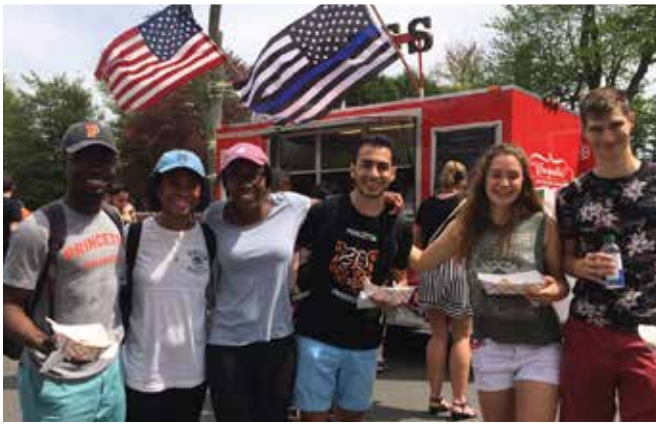
Cap and Gowners enjoying Princeton TruckFest

The following Cap members donated $100 or more to Cap and Gown in 2016. Thank you for your generous support!