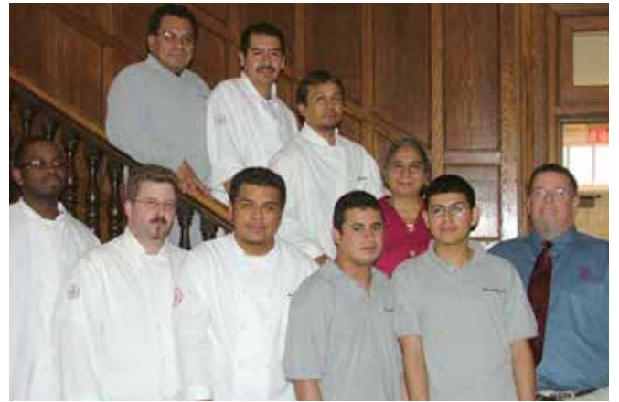
Cap and Gown staff circa 2005

The men of Princeton in the early years of club life found camaraderie in small groups finding lodging and meals about town in private residence and rooming houses. It seemed only logical and economical to buy or rent their own house and hire a cook for meals. So it began with a simple cook, evolving into a slippery existence somewhere between Delta Tai Chi and Downton Abbey. The Gildersleeve clubhouse, built at the end of the Victorian era required a functioning staff. The Cap and Gown Club, with twenty to forty members, employed a steward, cooks, service staff, housekeepers and housemen to oversee daily life, often summoned by the press of little mother of pearl buttons strategically placed about the public spaces of the clubhouse. As membership rose and daily operations became more involved a part-time business manager was hired to keep the club's books.