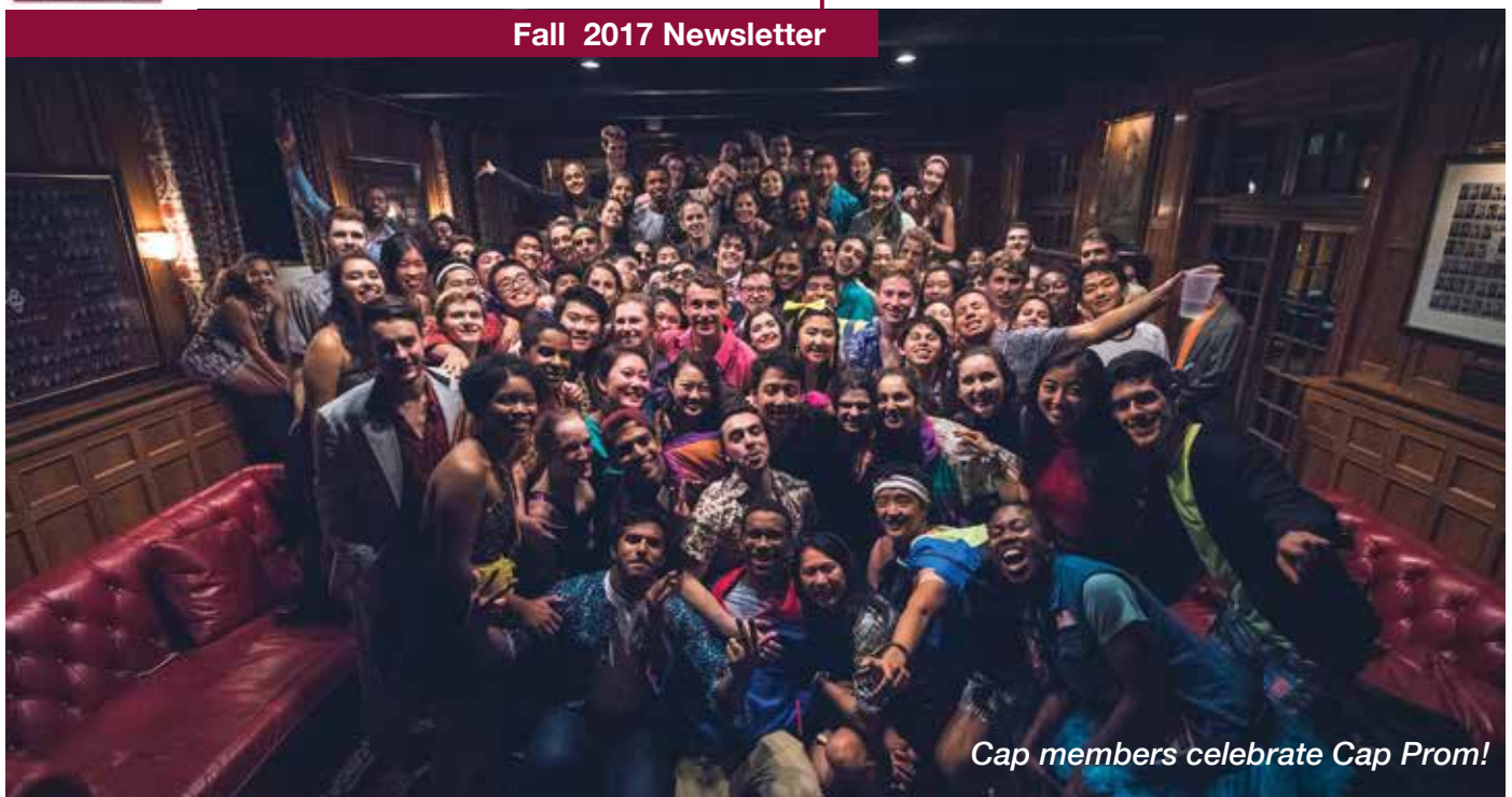
Cap members celebrate Cap Prom!