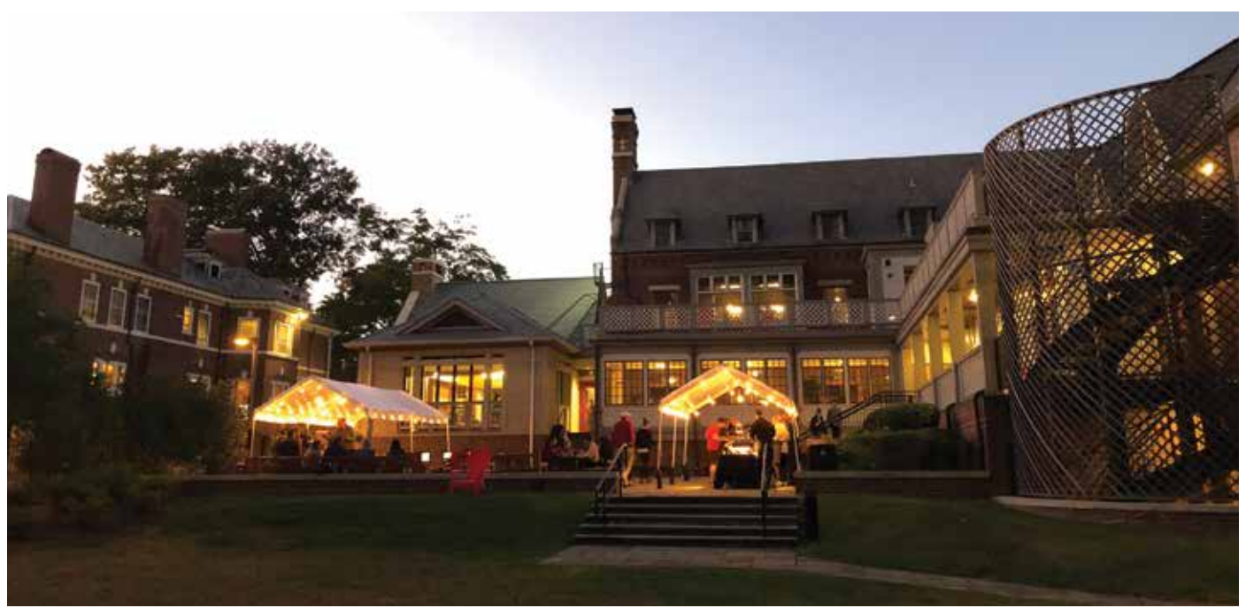
Parents' Weekend at Cap

Cost: Princeton financial aid has enabled these students to not only attend Princeton, but also participate in the club system. Unfortunately, University policies, described more fully in our last newsletter, still provide a powerful economic incentive for students to choose lower cost alternatives. Cap membership costs approximately $9,500 per year, including social fees. University financial aid policies allow students to "keep the money" if they don't join a club or drop their membership along