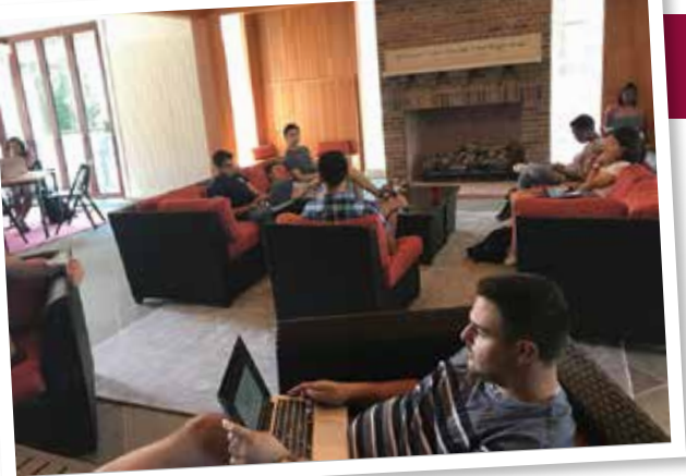
Fall weekend at Cap