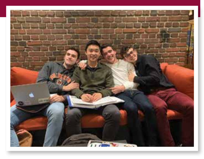
Members relaxing in the Cox Wing

This beautiful space is not only for studying, but has hosted much fun as well! The Cox Wing was completed just in time for members to enjoy the new space during Houseparties weekend